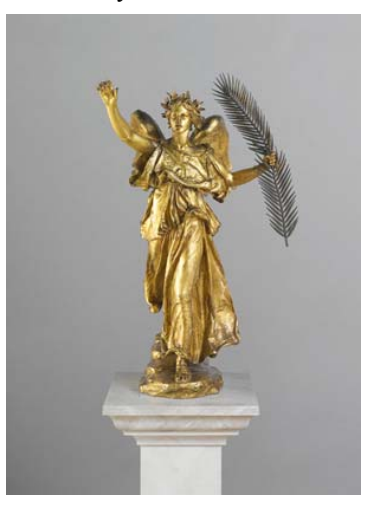
Saint-Gaudens' sculpture of Victory holding feather

In the early 20<sup>th</sup> Century President Theodore Roosevelt asked Augustus Saint-Gaudens, America's foremost sculptor to help improve the designs of our coinage. The highlight of the sculptor's efforts was the majestic Striding Liberty which first appeared on the $20.00 double eagle in 1907. The first version was struck in high relief with a Roman numeral date and even today is one of the most highly sought after coins, although expensive. Notice the similarity of the sculptured "Victory" above with the Striding Liberty on the coin shown below.