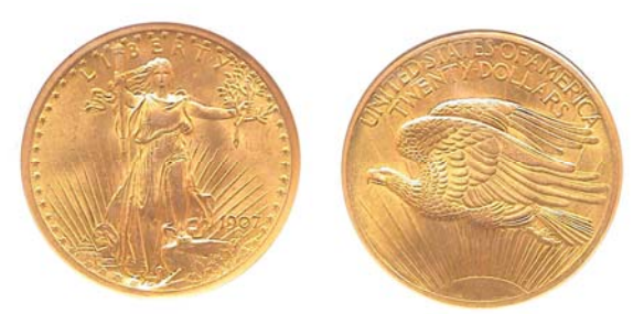
A 1907 Arabic numeral Saint-Gaudens $20.00 Gold piece The coin was graded MS-62 by NGC [Magnify to 200%]

The coin that the Saint-Gaudens type replaced was the Coronet Liberty design type originally crafted in 1849 by then Chief Mint engraver James Barton Longacre. It underwent a number of minor modifications during its 58 year run and is a rather handsome design but lacks the exquisite artistry of the coin that replaced it. After the initial release of the Saint-Gaudens type, the Mint decided to lower the relief, replace the Roman numerals with Arabic and it is this version that most collectors of moderate means have been able to afford.