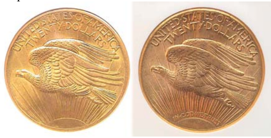
The motto is absent from the reverse on the coin at left. It is located between the rising sun and its extended rays on the coin at the right. From AU-58 through MS-63 the 1908 with motto sub-type is priced only slightly above the extremely common no motto variety and could be considered a "sleeper". [magnify to 200% to see details.]

As a result, there are two transitional sub-types for 1908. These can be included as part of the early 20<sup>th</sup> Century gold transitional dates set, but acquiring any of four coins now will be difficult due to the scarcity of the two low mintage varieties and the high price of gold for the two common ones. The 1908-P no motto $20.00 Saint-Gaudens has a mintage of over 4 million and is one of the most common dates of the entire series. When gold was priced at just $255 an ounce in mid 1999 one could obtain a MS-63 example for just $400. Today, it would cost around $1,600 retail. On the other hand, the 1908-P $20 Saint with motto has a mintage of just 156,258. It is 27 times scarcer than the no motto variety and one in MS-63 would cost only slightly more. A best-buy for the latter would probably be within the grade range of AU-58 through MS-62 but finding attractive specimens below MS-63 will be hard to find.