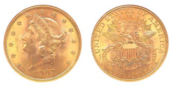
A 1907 Coronet $20.00 Gold Double eagle Certified mS-63 by NGC [Use 3x power glass or magnify to 200%]

The coin that the Saint-Gaudens type replaced was the Coronet Liberty design type originally crafted in 1849 by then Chief Mint engraver James Barton Longacre. It underwent a number of minor modifications during its 58 year run and is a rather handsome design but lacks the exquisite artistry of the coin that replaced it. After the initial release of the Saint-Gaudens type, the Mint decided to lower the relief, replace the Roman numerals with Arabic and it is this version that most collectors of moderate means have been able to afford.