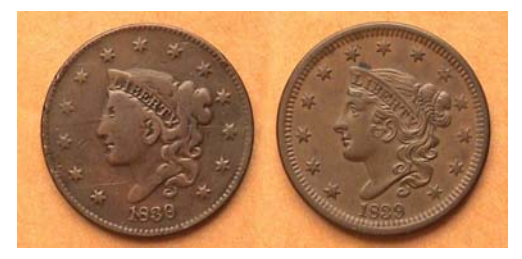
1839/6 N-1 and 1839 N-2 "Type of '38"

The Cents: In 1839 Chief Engraver Christian Gobrecht made several modifications to the cent design. First we have the 1839/6, a scarce variety (actually 9 over inverted 9; probably made in 1836). It shows a plain hair cord which was discontinued in 1837. The second is the "Head of '38", similar to what appeared later in 1837 as the beaded hair cord sub-type.