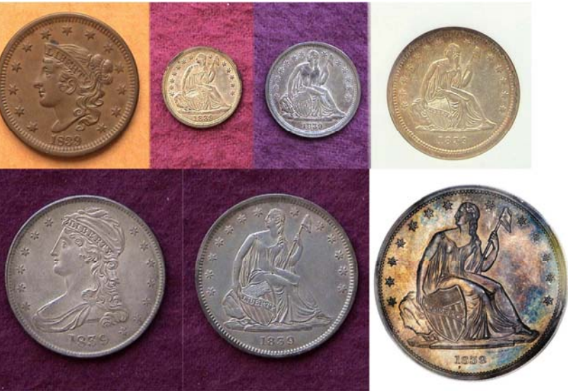
The obverses of a basic 1839 Year Set of US coins (excluding gold) All but the Gobrecht dollar at lower right are affordable [Use 3X glass or magnify page to 200% to see coin details clearly.]

1839: Another Amazing Year in US Coinage: 170 Years Ago By Arno Safran