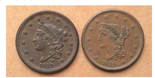
1839 1¢s obverses – Heads of '38 and '40 [Use 3X glass or magnify page to 200% to see details.]

Gobrecht made still another modification on the large cent in 1839, known today as the Petite Head. This became the standard smaller head type large cent appearing on the large cents from 1840 on.