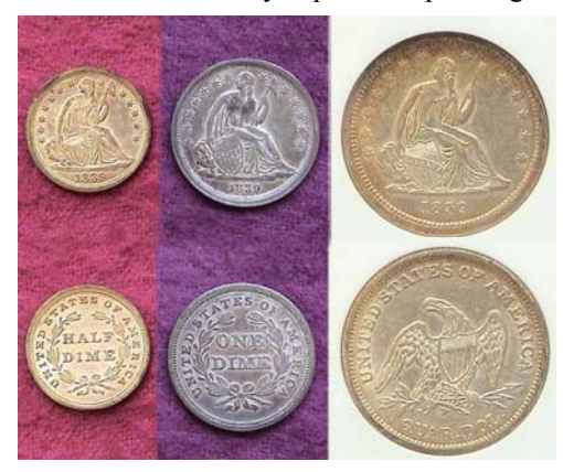
1839 circulated Liberty Seated 5¢, 10¢ and 25¢ Starting with the Liberty Seated design type in 1837, The eagle was replaced by a wreath on the half dime and dime. [Use 3X glass or magnify to 200% to view details.]

The minor Silver coins and the Quarter: The Liberty seated half-dimes, dimes and quarters of 1839 were unchanged from 1838 except for the date. All are represented by the no drapery subtype that would be 'rectified' by mid 1840. None of these denominations are unduly expensive up through AU-58.