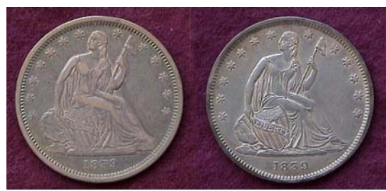
The 1839 no drapery and with drapery Liberty Seated 50¢ types [Use 3X glass or magnify to 200% to view details.]

In later years a number of restrikes were made like the one pictured above and these are likely to be more available if you consider a coin priced at more than $20,000 within your budget. While the vast majority of us will never be able to afford such a coin, the 1839 dollar is a beautiful work of art and it is a pity that the design was wholly emasculated in 1840.