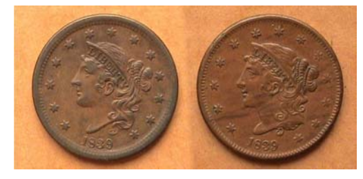
The 1839 Silly Head and Booby Head Large Cents [Use 3X glass or magnify page to 200% to see details.]

This was followed by two less successful 1839 renditions nicknamed the Silly Head and the Booby Head . Unlike the previous, both display a protruding curl on the forehead. The Booby Head however shows no hair at all at the lower right of Miss Liberty's coiffure.