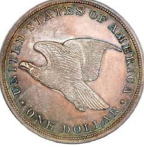
An 1839 Proof $1.00 certified PF-61 by PCGS It realized $21,850 at the Heritage Auction held on Sept. 9, 2009 [Use 3X glass or magnify to 200% to view details.]

The Dollar: Arguably, the most exquisite coin of 1839 is the Gobrecht dollar design type. Originally, this coin, like the 1836 dated no stars on the obverse versions, was thought to be a pattern since only 300 proofs were made, but due to the research of Robert Julian and others, it was determined that both the 1836 and '39 issues were bone fide coins of the realm having been placed into circulation despite their respective low mintages. Since the stars had been restored to the obverse on all the other silver denominations including an 1838 pattern Gobrecht dollar, it was no surprise to see this feature continued on the dollar in 1839. The 26 stars originally surrounding the soaring eagle on the 1836 Gobrecht dollar were removed leaving the eagle soaring in an empty field surrounded by the legend, UNITED STATES OF AMERICA and ONE DOLLAR below.