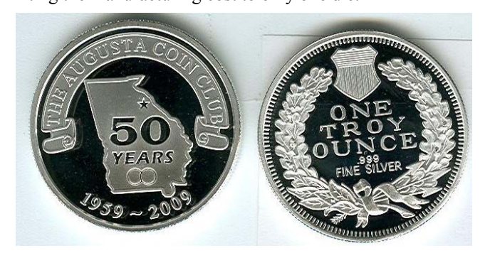
The 2009 one ounce .999 fine Silver Medallion Actual size when printed.

popularity of the obverse design, coupled with the Oak wreath Indian Head cent reverse saved each member between $12 and $15 and probably saved the club even more since the reverse die for the design used was a stock item of the Golden State Mint limiting the manufacturing cost to only one die.