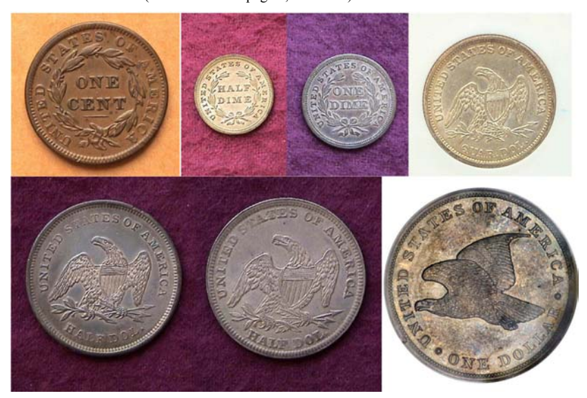
The reverses of a basic 1839 Year set (excluding gold) Only 300 Gobrecht dollars were minted in 1839. [Use 3X glass or magnify page to 200% to see details.]

The reader will observe that among the two sides of the basic 1839 year set shown on page 1 and directly above there are two different types for the half dollar denomination; the outgoing Capped Bust-Reeded Edge and the new Liberty Seated types thereby continuing the annual parade of transitional date design-type pairings begun in 1837.