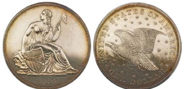
An 1836 Gobrecht $1.00, J-60 original graded Proof-62 by PCGS [Use 3 x glasses or magnify to 200%]

In 1836, the new Chief Engraver Christian Gobrecht produced a Liberty Seated dollar with a Soaring Eagle in a sea of stars reverse that is today regarded one of our most exquisite coins.