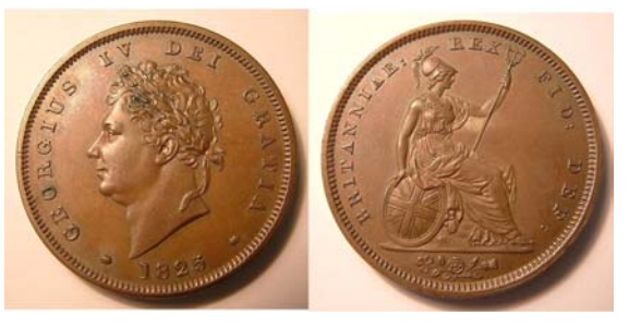
An 1825 Proof Penny of George IV Showing a more regal Britannia facing right [Use 3 x glasses or magnify to 200%]

Through the reign of King George III, the representation of Britannia is artistically improved but is still seen facing left.